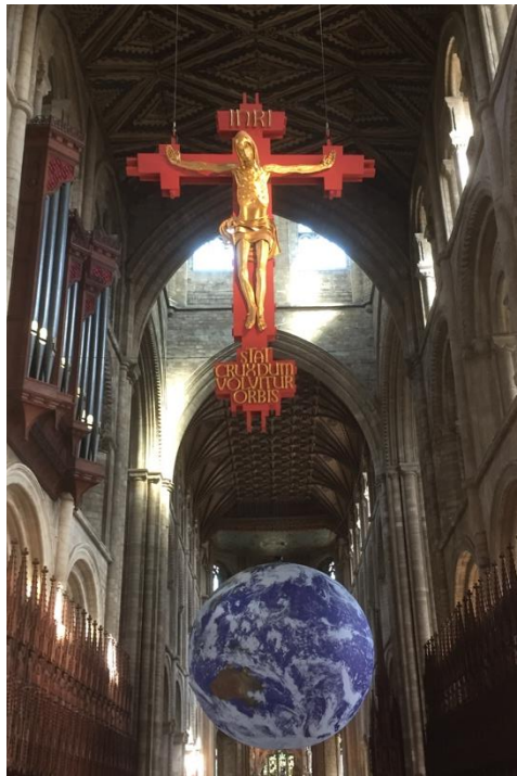
"Stat Crux Dum Volvitur Orbis" The cross stands steady as the world turns

Material in these services are from "Common Worship: Services and Prayers for the Church of England" which are Copyright The Archbishops' Council 200-2006